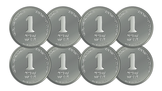
generates NIS 8.15

Each shekel invested in the mentoring process generates a return estimated at NIS 8.15 in addition to a return which is incalculable.